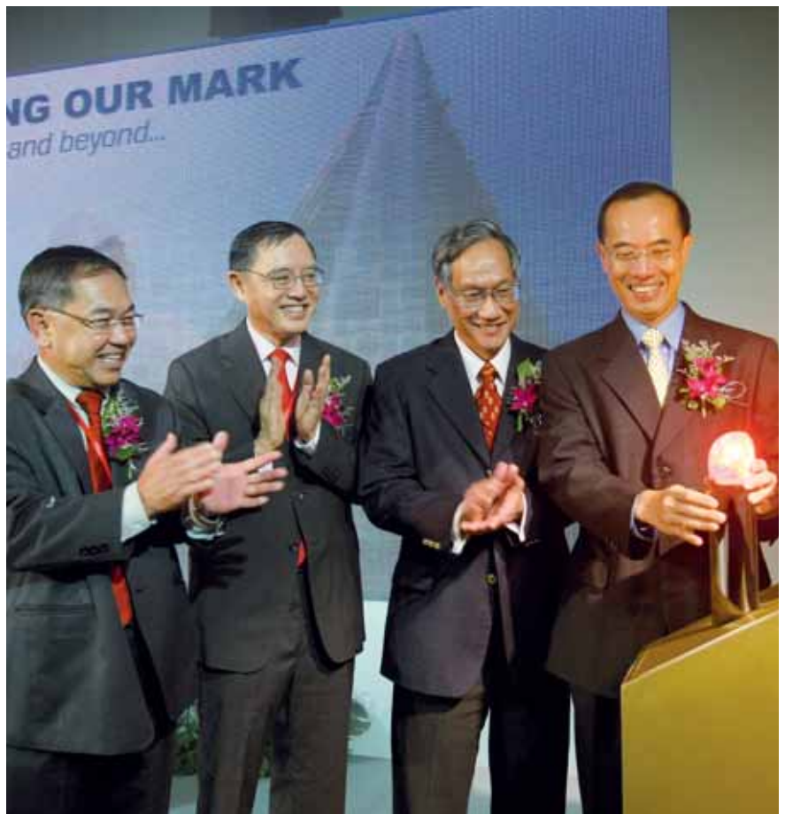
Celebrating Keppel O&M's 5th anniversary, Mr George Yeo, Minister for Foreign Affairs, together with Keppel's senior management launched KOMtech as well as the book More than Mettle: The Keppel Offshore & Marine Story .

It is our hope that the book, along with our challenges and achievements in the last five years, will inspire our people to take the Company into the future.