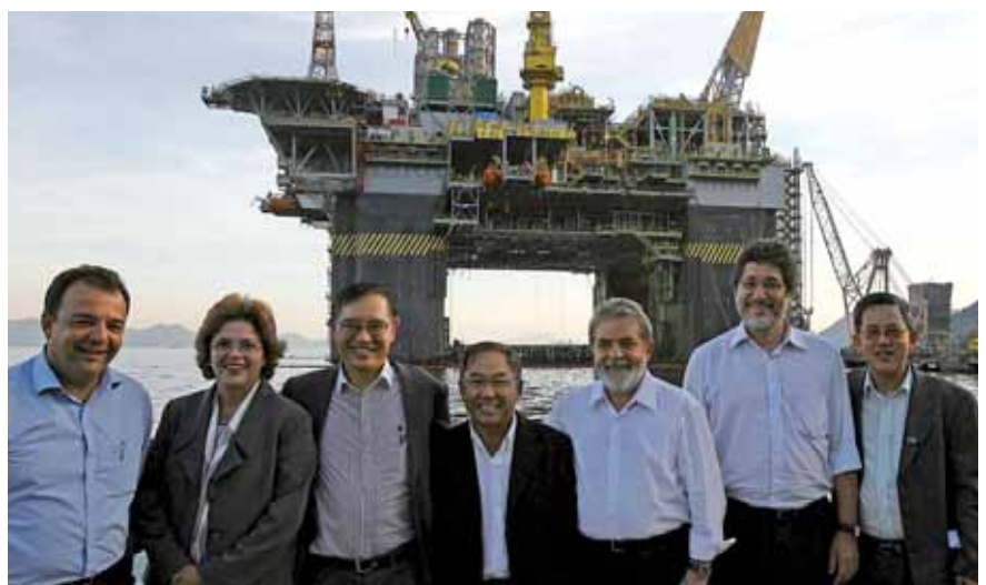
Building on our presence – The christening of P-52 in June 2007 was officiated by President Luiz Inácio Lula da Silva of Brazil (third from right) and the Keppel and Petrobras teams.

Our investments in research and development (R&D) have helped to establish Keppel O&M as the leading