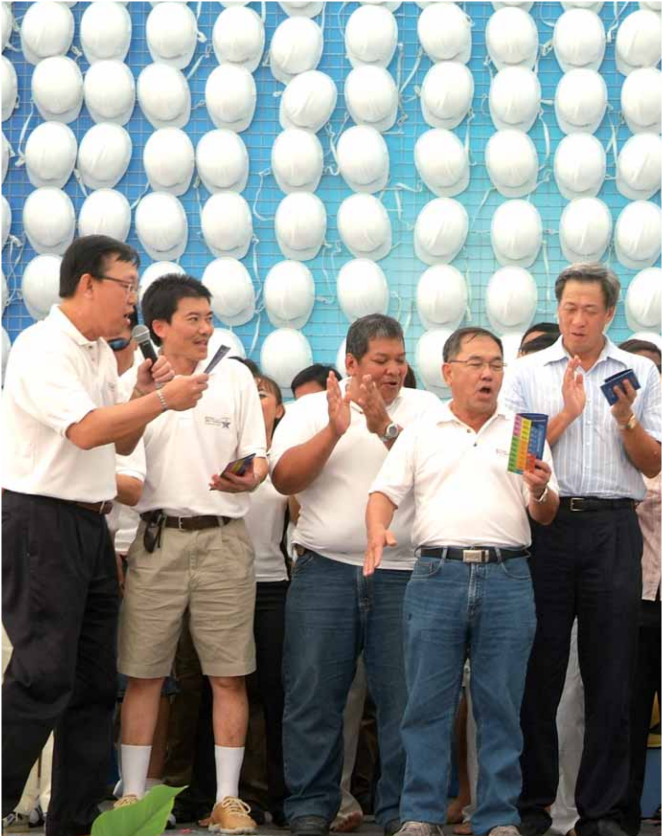
Joined by Dr Ng Eng Hen (extreme right), former Minister for Manpower, and members of the Union, Management led employees in the Keppel O&M song during the Company's 2007 Family Day at Sentosa.