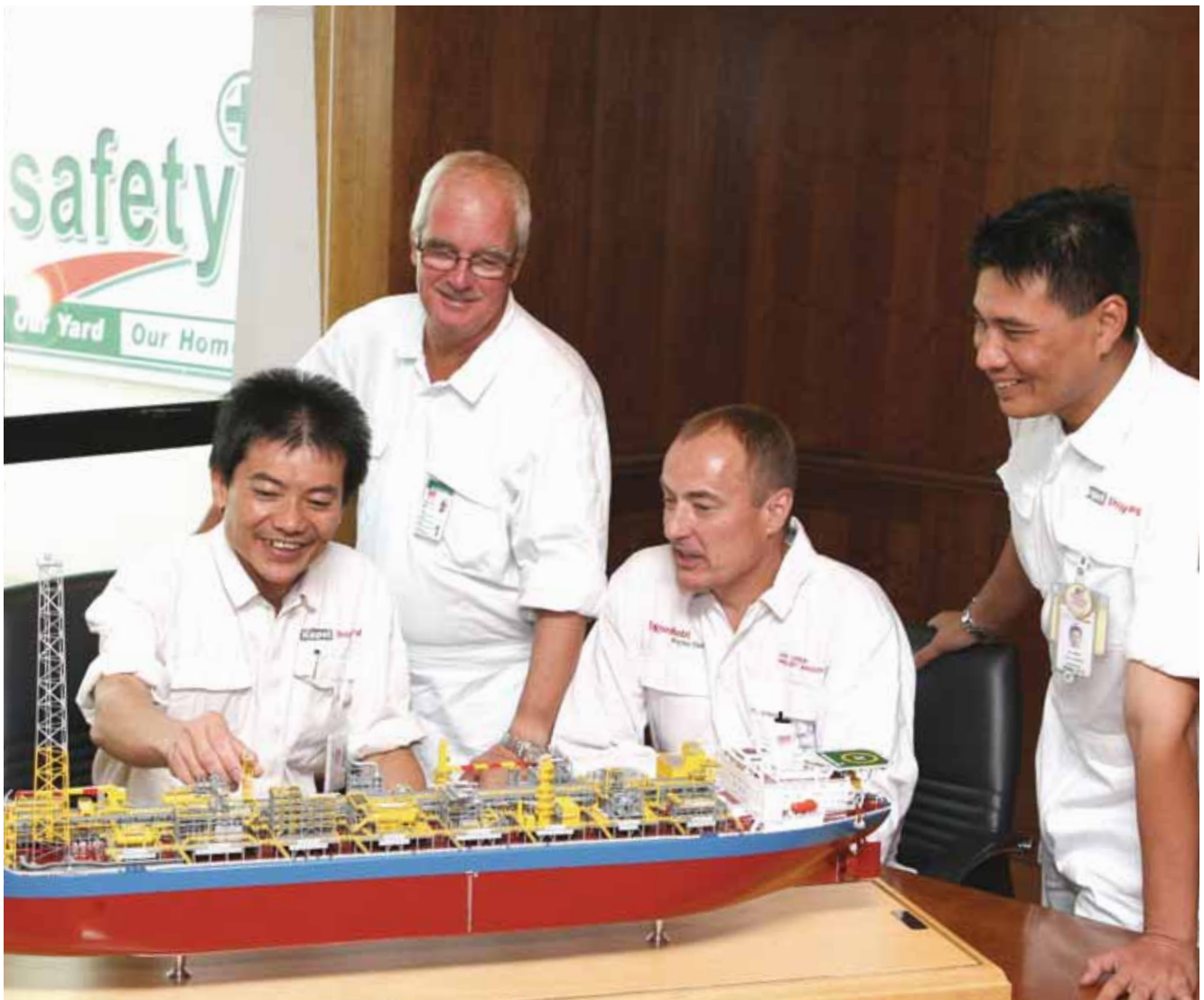
Safety is a collaborative effort – client representatives from ExxonMobil and SBM play an active role in Keppel Shipyard's Safety Steering Committee.