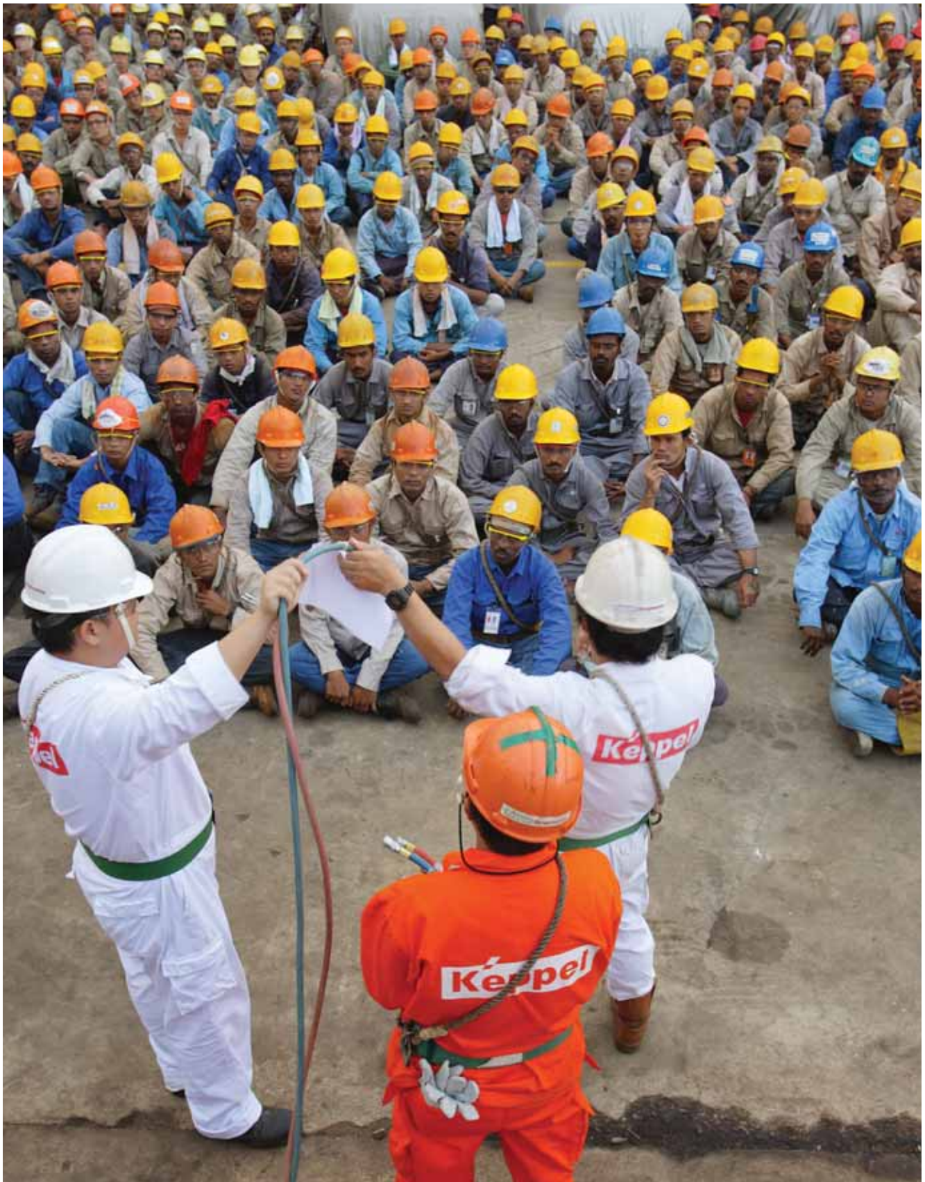
Workers learn the ropes of safety from their mentors.